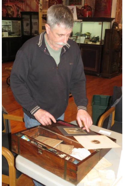
And it wasn't empty! The desk was full of more treasures: